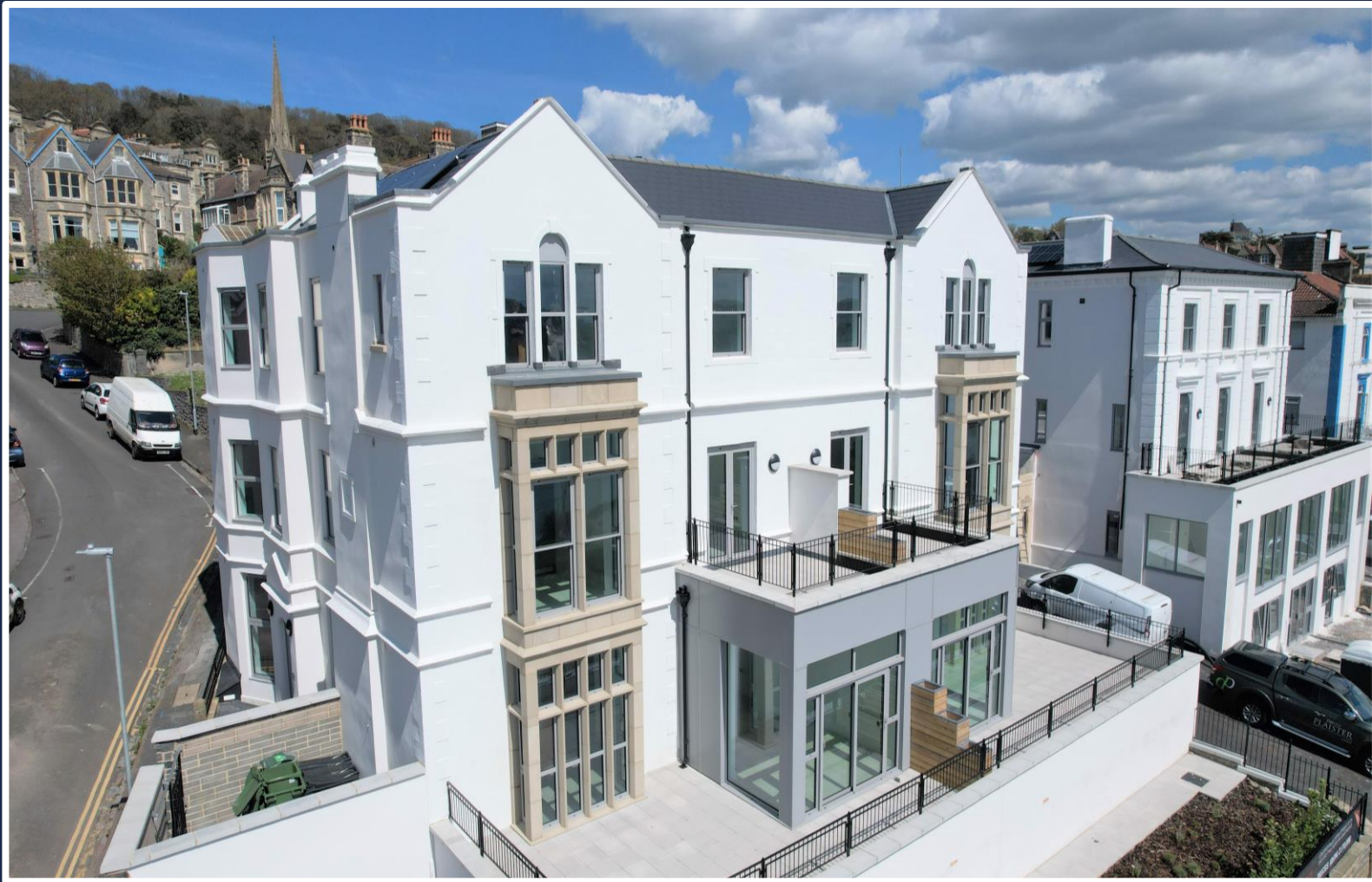
Apartment 4 Madeira Lodge, 40 Birnbeck Road, Weston-super-Mare, North Somerset, BS23 2BX